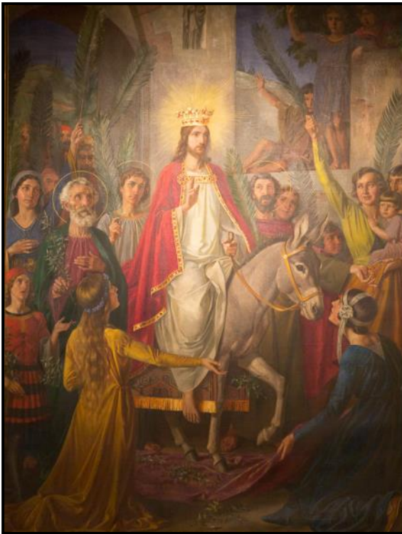
Cathedral Basilica of Christ the King, Hamilton.

“Truly I tell you, just as you did it to one of the least of these brothers and sisters of mine, you did it to me.”